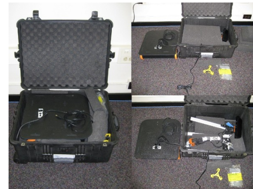
Figure 2: Maxwell, disassembled for shipment and packed in a Pelican case.

The column is constructed of three individual pieces and is easily removed from the base, allowing Maxwell to be disassembled into pieces with no dimension larger than 20 inches, allowing for easy shipment or transport in a protective case as seen in Figure 2. Disassembly of the column requires removing only 10 screws, allowing Maxwell to be disassembled or reassembled in minutes.