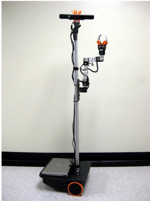
Figure 1: Maxwell, a human-scale mobile manipulator.

is large and bulky to move about, we designed Maxwell such that he could be quickly broken down into several sections for easy transport. This is especially important should the robot be entered in any of the many competitions and benchmarks which require travel, such as the ICRA or AAAI mobile manipulation challenges, or the international RoboCup@Home contest [8].